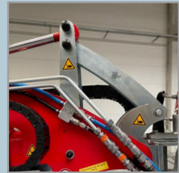
Special articulated joint included