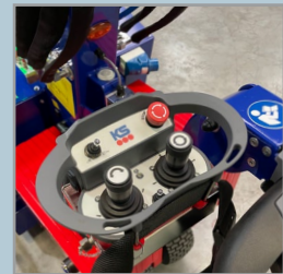
Servo remote control