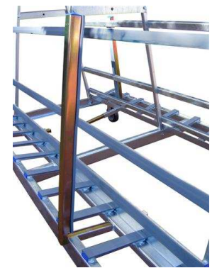
Safety Arm out