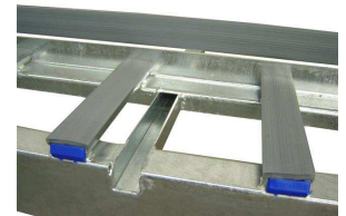
Safety Arm base slot