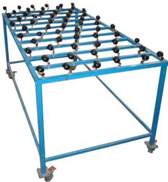
6 ½" x 3" ball transfer table