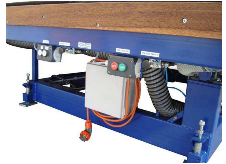
Table dimensions typically relate to the size of stock sheet to be cut and processed on each table.