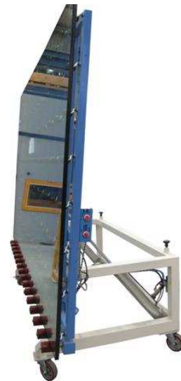
13" x 8" tilting ball table