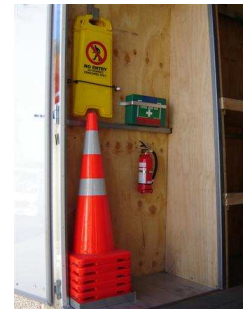
Safety gear storage area.