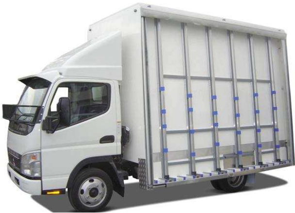
Full external frails with Metalcraft securing poles.

GET FULL PRODUCT CATALOGUES ONLINE AT WWW.THEGLASSRACKINGCOMPANY.COM