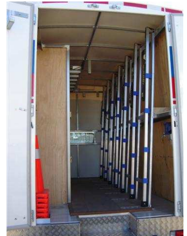
Internal glass rack with secure strap poles.