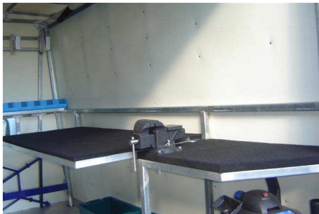
Workshop bench options designed to suit.