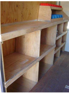
Shelving and bench unit.