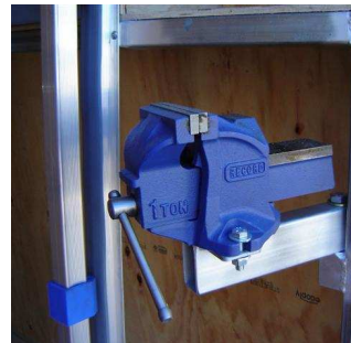
Swinging vice option.