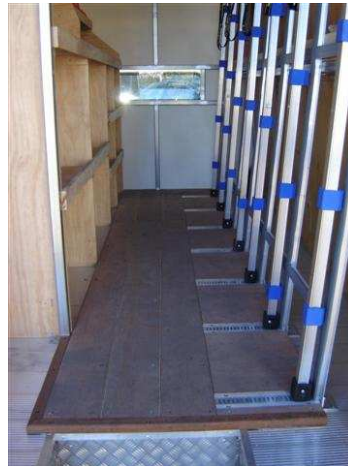
Hardwood timber floor with inlaid pole locating plates.