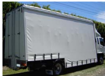
6.7M 13500KG GVM