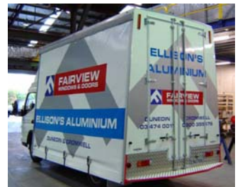
4M 5600KG GVM BRANDED

Free call within NZ 0508 323 373 / Email: info@metalcraft.co.nz