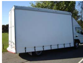
4.8M 7500KG GVM

So think dry-side curtains to beat the weather and visit our web site to view our range of Covered Trucks options under the Glass Handling menu tab.