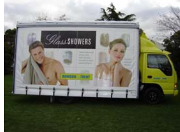
FULLY BRANDED CURTAINS