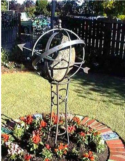
Rock sphere & base for TVNZ