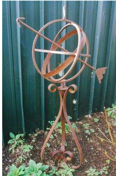
400mm raw sphere & base