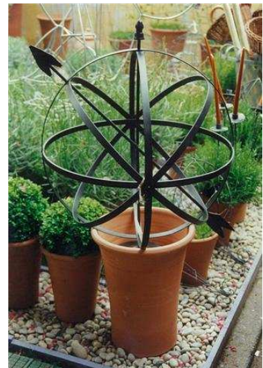
600mm mild steel sphere

IT IS KNOWN THAT BOTH THE GREEK AND ROMAN CIVILISATIONS USED SUNDIALS EXTENSIVELY AND BY THE RENAISSANCE THEY WERE SO COMMONPLACE THAT THEY WERE REGULARLY FINDING THEIR WAY INTO ENGLISH LITERATURE.