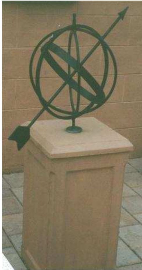
400mm black sphere and base