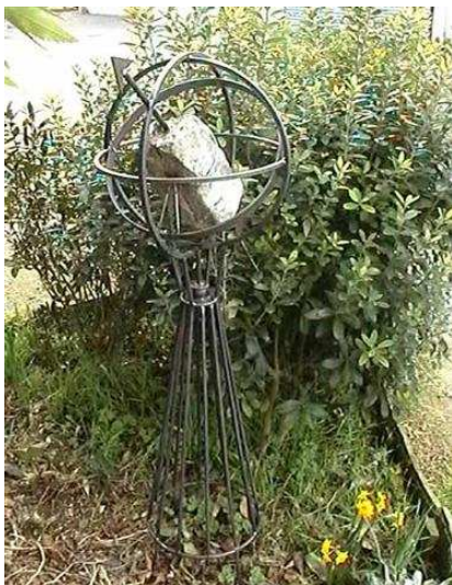
400mm x 1.5m tall white rock sphere

THE HISTORY OF THE SUNDIAL IS INTERESTING WITH THE EARLIEST RECORD BEING 1500BC.