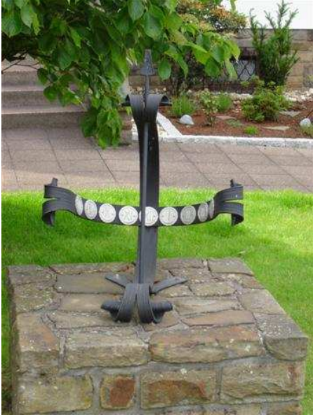
Iron feature sphere as seen in Germany