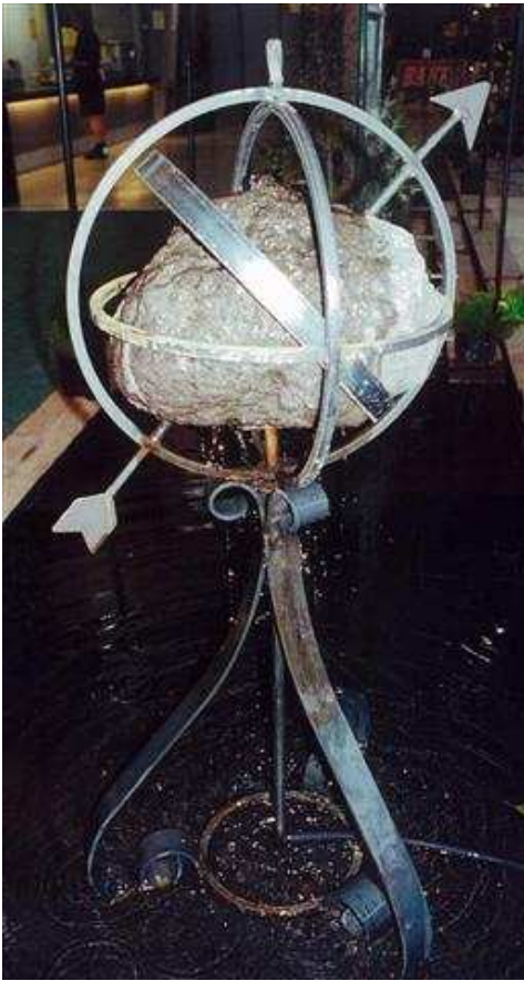
600mm raw water feature sphere and base