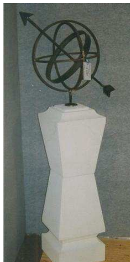
400mm raw sphere with white stone base

CLASSICAL ARMILLARY SPHERES WERE DEVELOPED BY THE ANCIENT GREEK ASTRONOMER PTOLEMY.