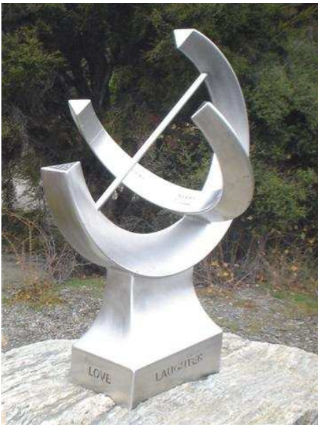
Stainless steel sphere as seen in Wanaka, NZ

OUR ARMILLARY CELESTIAL SPHERES ARE ORNAMENTAL SUN DIALS WHICH CAN ALSO BE MANUFACTURED WITH PEDESTALS.