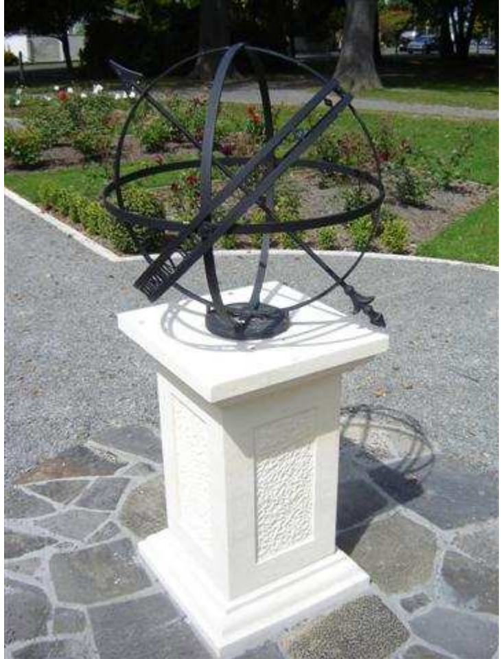
900mm sphere & base