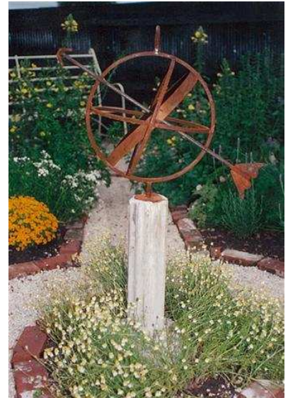
400mm raw steel sphere on pedestal